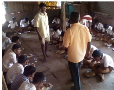
Students at the Rural Sponsorship Project