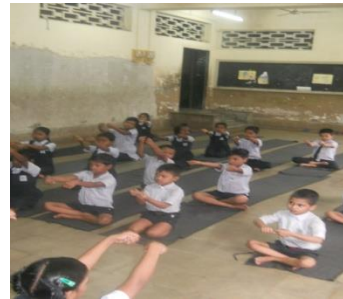
Glimpse into Yoga and Dance activities!!