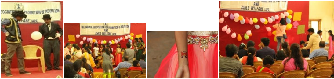
Kites, balloons, tattoos, games, magic show..... lot of fun!!