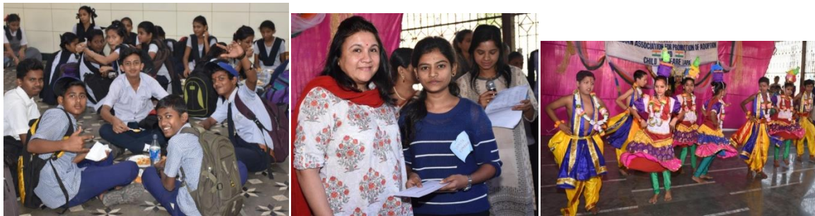
Happy times at the annual get-together