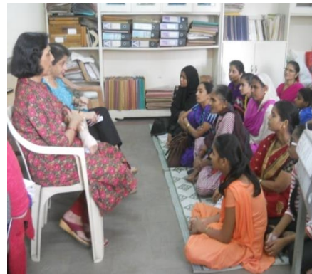
The session in progress

This session on 9 th January 2017 was facilitated by Child Guidance Centre (CGC) panelists of IAPA's Mental Health Programme.